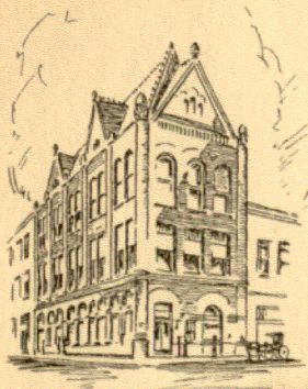
1912. First location of American Trust and Banking Company—corner of Broad and 8th Streets.

This month marks the 35th anniversary of American Trust and Banking Company. The bank was organized in January 1912 and since then our deposits have grown from $381,042.11, at the end of the first year, to $57,395,557.13 at the close of 1946.